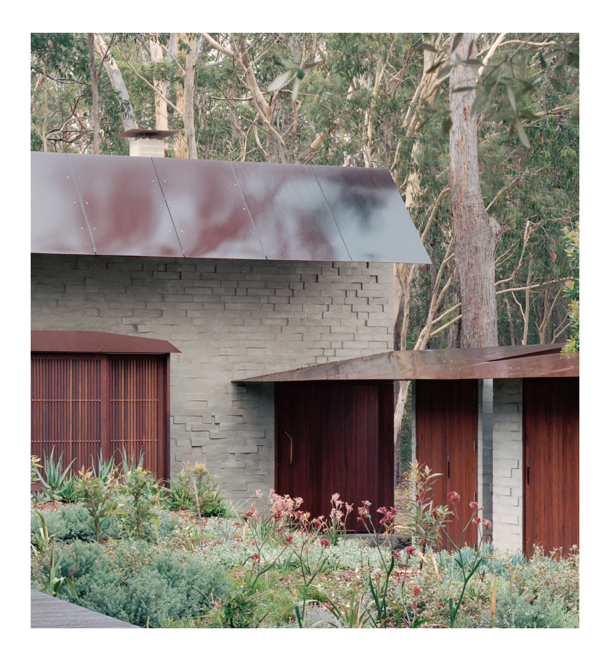
N°7 Architecture and Design of Australia and New Zealand

House at Flat Rock BILLY MAYNARD • Waterview JOHN WARDLE ARCHITECTS • St Andrews Beach House WOODS BAGOT • Arcadia ARCHITECTURE ARCHITECTURE • Under Ivy JACK MCKINNEY ARCHITECTS Arakoon SHAUN LOCKYER ARCHITECTS • Courtyard House HA ARCHITECTURE — AND MORE